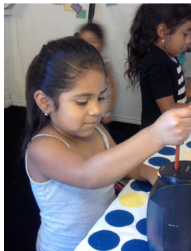
She loves the pencil sharpener

It has begun! The first week, 35 kids attended and 3 mothers volunteered from Garden Ridge. The kids finished all of the homework. Lucy, a Garden Ridge Volunteer and Sherry worked with the K - 2nd grade group with their homework and they played alphabet bingo to learn their English letters. Grisleda, another Garden Ridge volunteer, helped in the toddler room with children from 2 to 4.